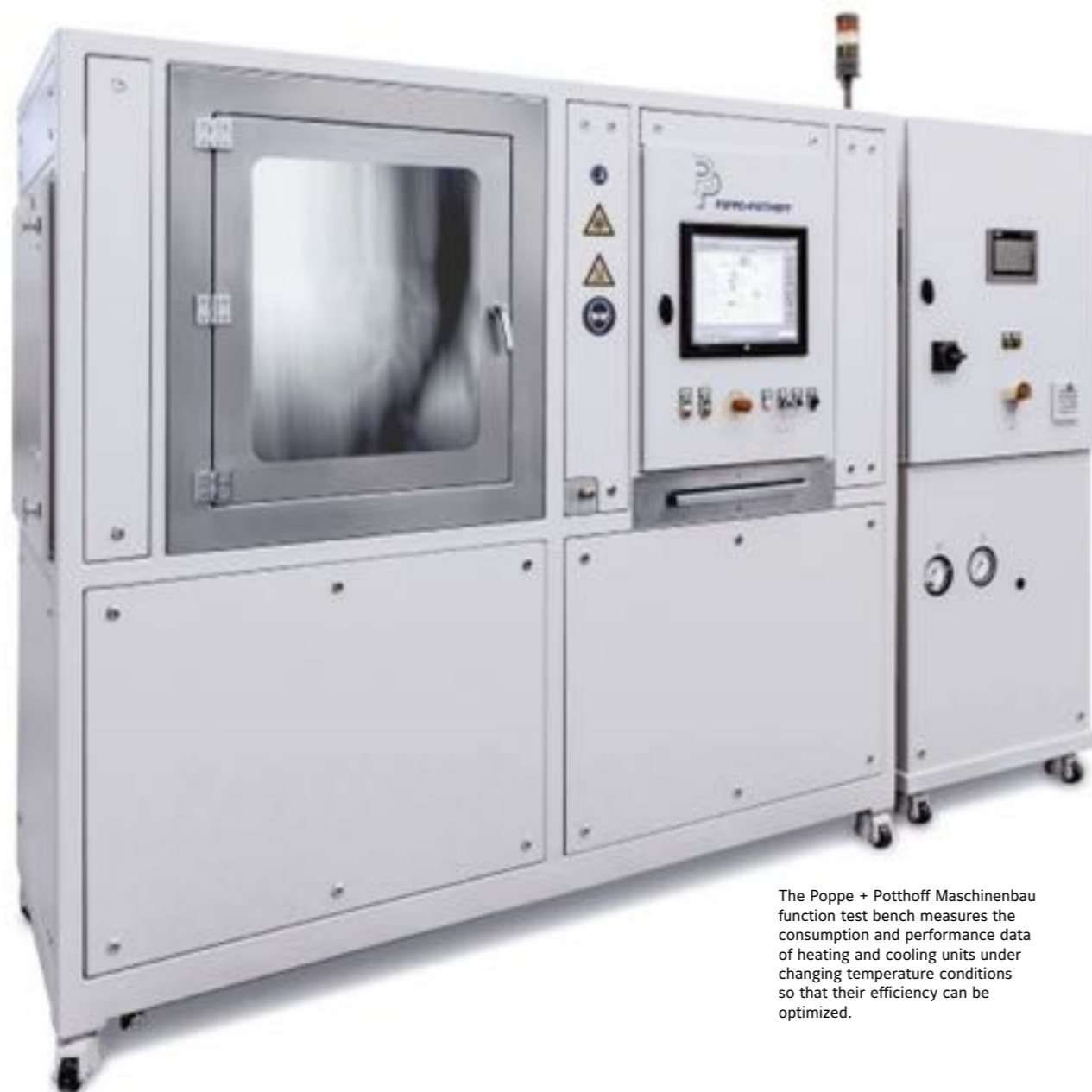
The Poppe + Potthoff Maschinenbau function test bench measures the consumption and performance data of heating and cooling units under changing temperature conditions so that their efficiency can be optimized.

In many EVs, the heating and cooling systems drain the battery and negatively affect the vehicle's range. Comparison of test results before and after a load test on the pressure cycling test bench can show how power consumption and performance change over the vehicle's service life. The test object is connected to the power supply (low voltage 0-20VDC/5A) or high voltage (0-600VDC/150A) and the test media circuit. The test medium is circulated at a temperature of between -35°C to +100°C (-31°F to +212°F) and a flow rate of 1-50 l/min. The test can also be carried out in a climatic chamber at -40°C to +140°C (-40°F to +284°F) simulating changing ambient temperatures.