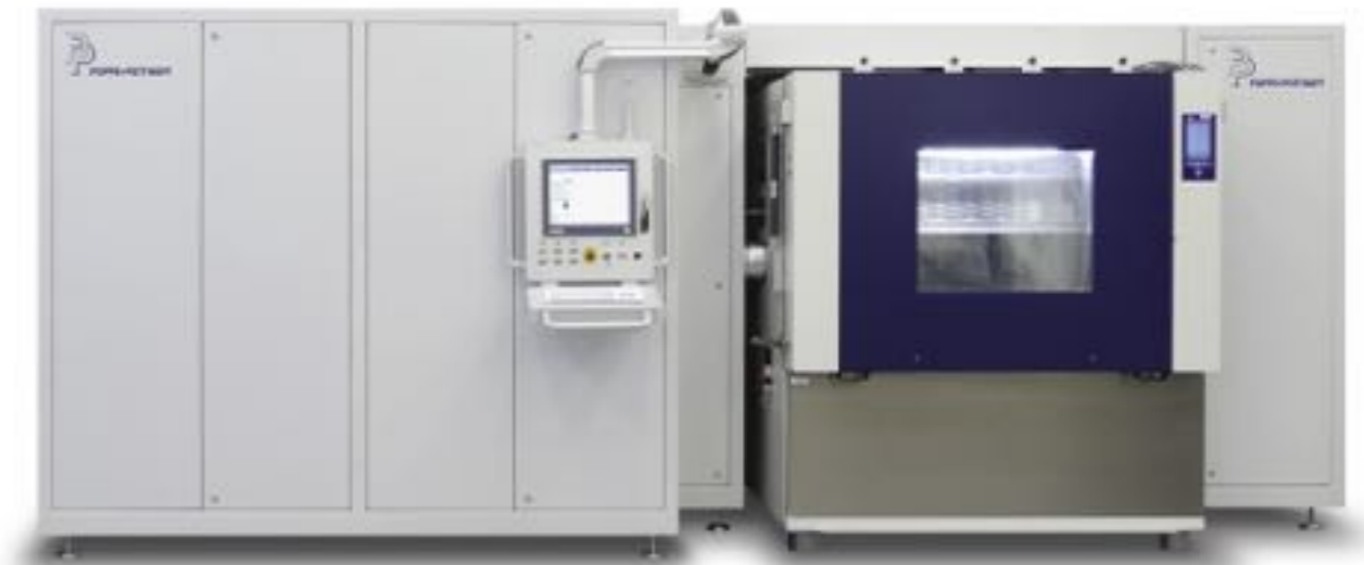
Pressure cycling test stand with climate chamber

The integrated LabView software from National Instruments enables efficient data acquisition and visualization. Test procedures and data are automatically stored on the system and can be exported to the network for evaluation. The open software structure makes it possible to integrate additional sensors and data during testing. Poppe + Potthoff Group can provide numerous testing services, remote maintenance and on-site technicians, if necessary.