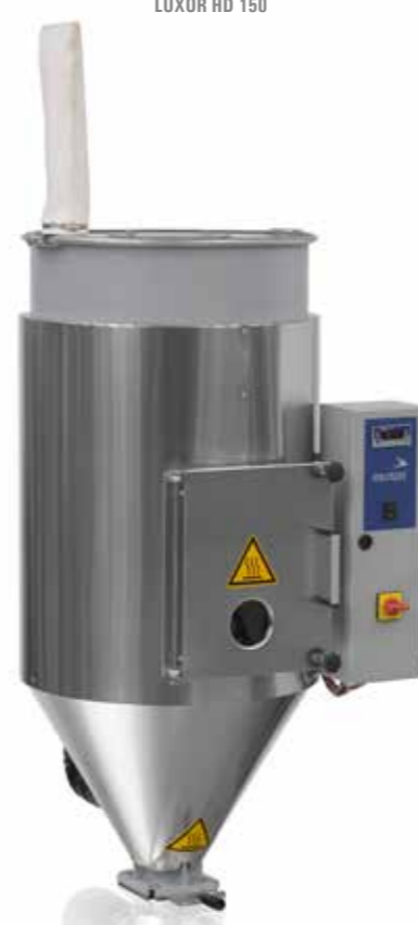
LUXOR HD 150