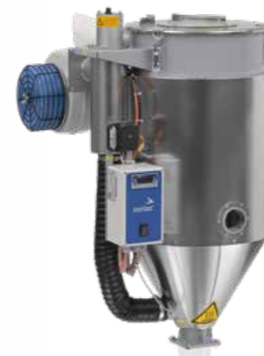
LUXOR HD 60