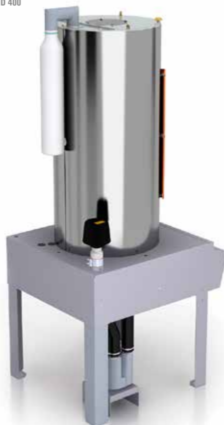
LUXOR HD 400