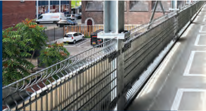
INTEGRA-pw Extra Glare shield smooth plate, nature

Sheet covering as simple glare protection measures comprised of plain or perforated plates are expandible without the need for additional substructure directly with INTEGRA-pw. In this manner, emissions from light beams from vehicles can be limited.