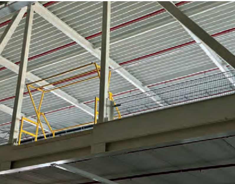
INTEGRA-pw 0.1 balustrade safety barrier, area of use: Mezzanine