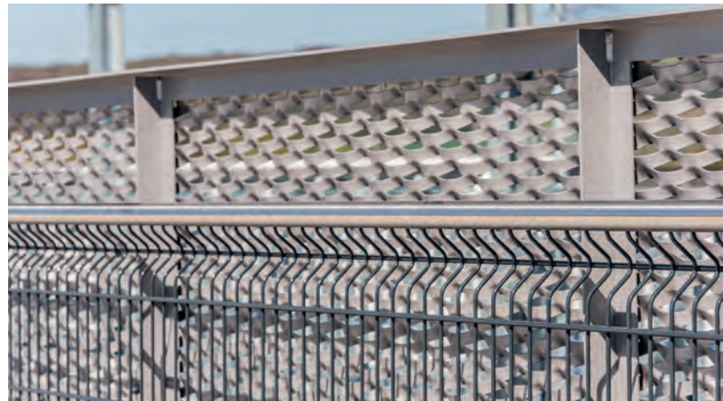
INTEGRA-pw Extra – Handrail stainless steel