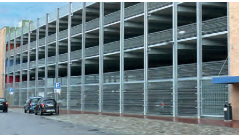
INTEGRA-pw Lock Ground floor