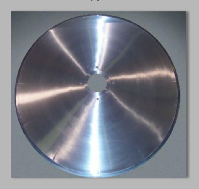
Material: Heat-resistant alloy Sharpening type: symmetrical, one-sided Diameter: from 250 mm to 1000 mm End Type: radius Material processing: mineral wool