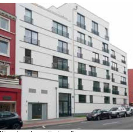
Müggenkampstrasse - Hamburg, Germany