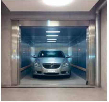
Underground car park - Zurich, Switzerland