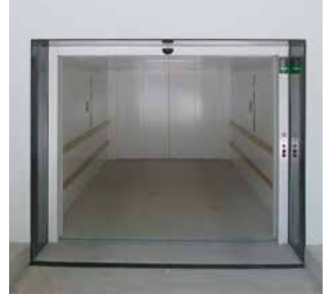
Bollerweg - Wädenswil, Switzerland