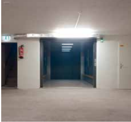
Dorfstrasse, Winterthur - Zurich, Switzerland