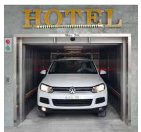
Garage Swissotel - Zurich, Switzerland