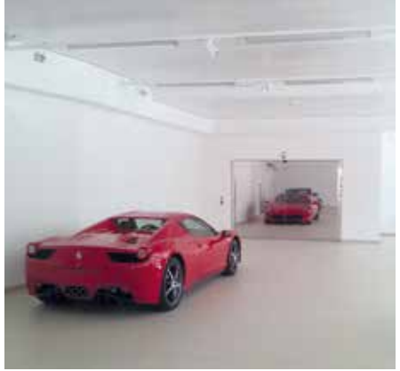
Garage Zenith SA - Sion, Switzerland