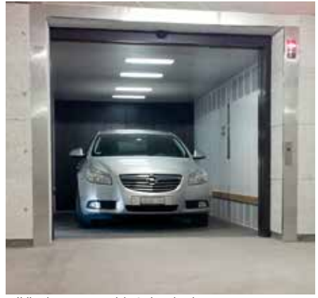
Wildbachstrasse - Zurich, Switzerland